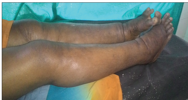
Figure 1: Bilateral nonpitting pedal edema

showed numerous microfilariae in a background microcytic hypochromic red blood cell and few lymphocytes. Since the patient was pregnant, diethylcarbamazine (DEC) was not advised.