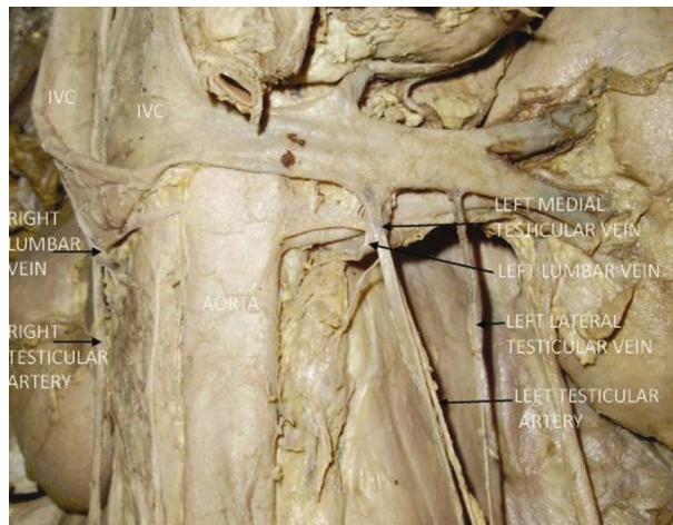
Figure 2: IVC has been turned upwards to show right testicular artery sandwiched between IVC dorsally and right lumbar vein ventrally. Left testicular artery is seen hooking the left lumbar vein and passing dorsally to the left medial testicular vein. IVC, inferior vena cava

then crossed ventrally over the artery, and finally terminated at an obtuse angle on the inferior aspect of the left renal vein just anterior to the termination of the left lumbar vein into the left renal vein. The left lateral testicular vein passed dorsal to the left testicular artery, coursed cranially, and drained into the ipsilateral renal vein lateral to the left medial testicular vein at a right angle. On the right side, the right testicular vein (17 cm long) left the deep inguinal ring, crossed ventrally over the psoas major and ureter, and ascended cranially at first along with the right testicular artery, then lateral to it and finally terminated on the inferior aspect of right renal vein at an obtuse angle.