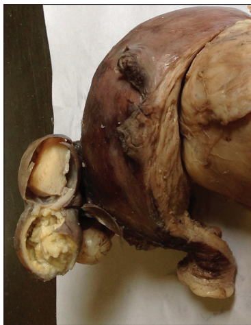
Figure 1: Photograph of uterus with cervix and dilated right fallopian tube containing yellow material

of Aspergillus species [Figure 2]. There was follicular cyst in the ovary.